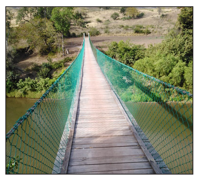
Suspension foot bridge over Rio Teluca.