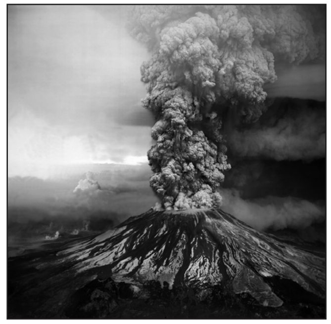
Aerial view of the May 18, 1980, eruption of Mount St. Helens as seen from the southwest. Columns of ash and volcanic gas reached heights of more than 24 km (80,000 ft) during the eruption. - public domain

Compiled by Elaine Butcher from listed references