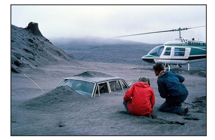
USGS geologist Don Swanson (in red) and his colleague, Jim Moore, view a car filled with ash deposits from the May 18, 1980, eruption of Mount St. Helens. Additional photos of the 1980 eruption of Mount St. Helens are posted on the USGS Cascades Volcano Observatory website: https://volcanoes.usgs.gov/volcanoes/st_helens/st_helens_ gallery 23.html. - Public Domain