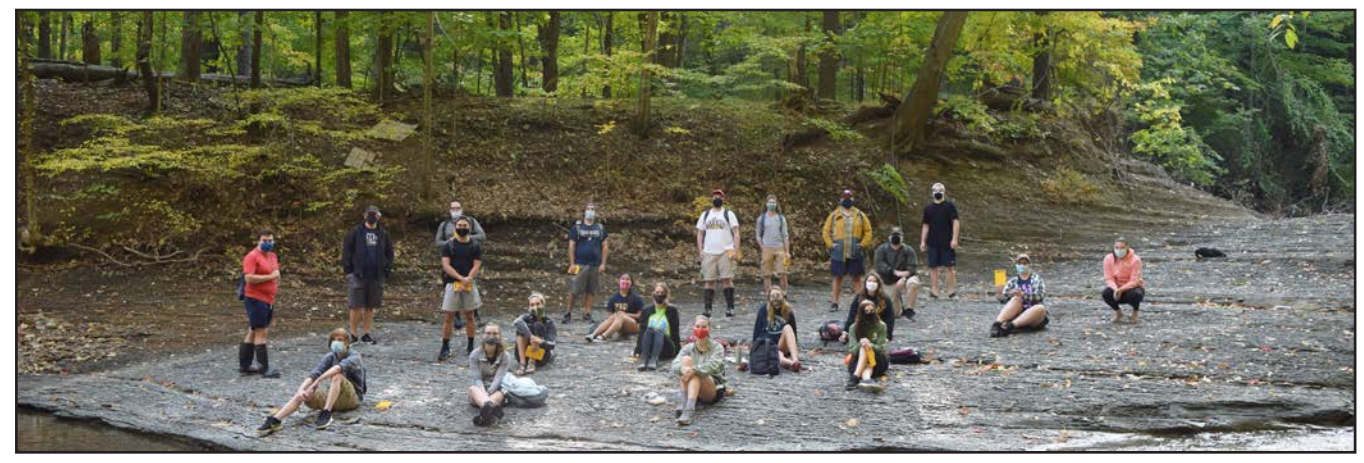
Structural Geology field trip 2020.