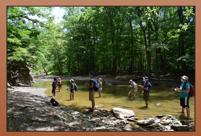
With COVID protocols in place, field camp was conducted locally. In this photo Dr. Peck explains a fault in Ohio to a socially distanced group of students.